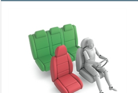
Maxi Cosi Cabriofix (Belt)