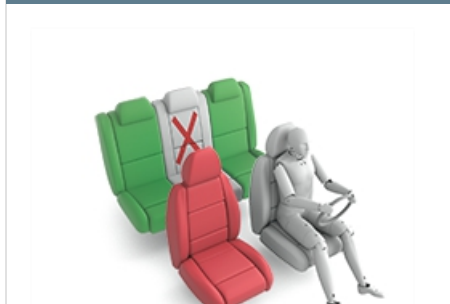
Maxi Cosi Cabriofix & EasyBase2 (Belt)